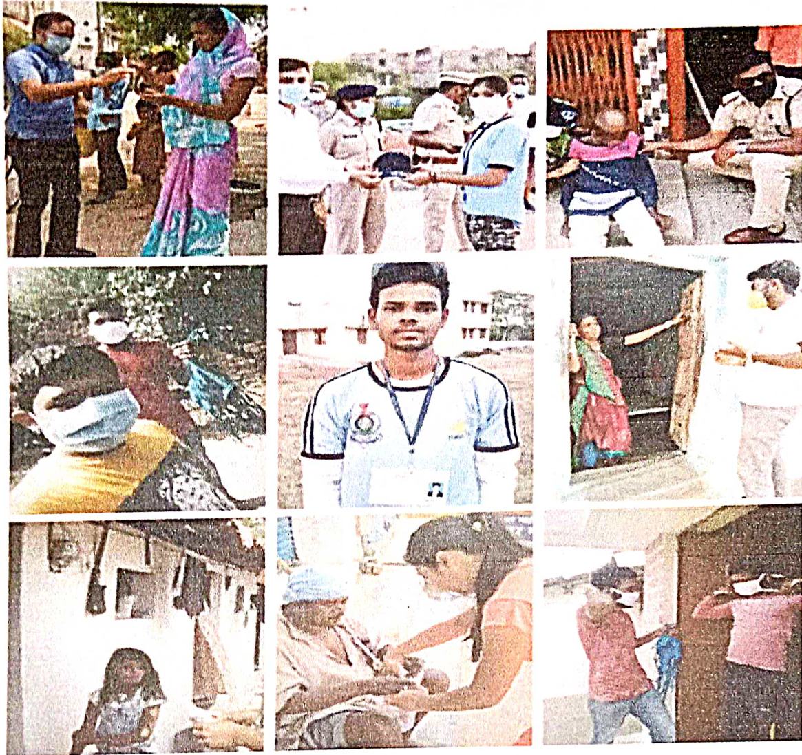
Social Awareness activities of students in nearby villages